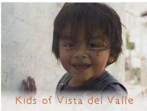
Kids of Vista del Valle