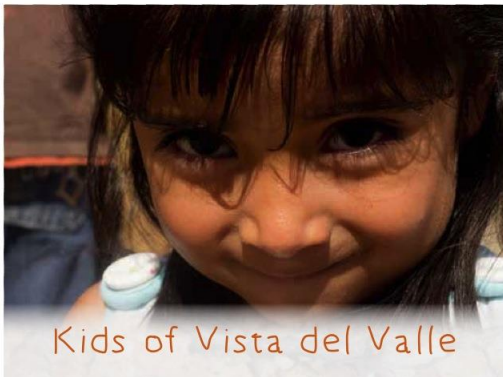
Kids of Vista del Valle