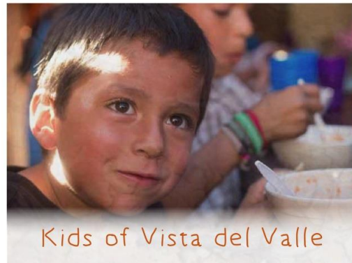
Kids of Vista del Valle