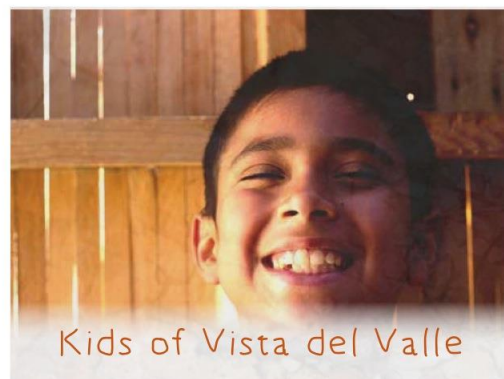
Kids of Vista del Valle