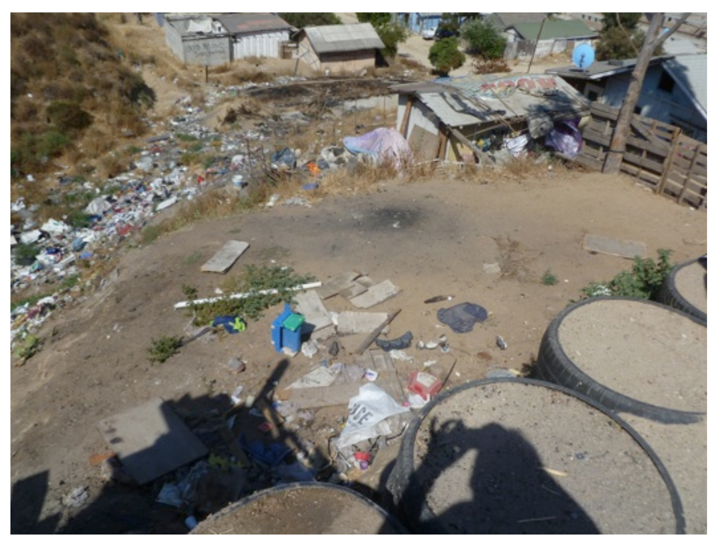
BACKYARD OF ONE OF OUR CHURCH FAMILIES WHO HAS 7 CHILDREN UNDER 12 AND THE PARENTS ARE 27 YEARS OLD! THEY CLEANED UP THE TRASH BUT THE NEIGHBORS THREW IT OUT AGAIN. THIS FAMILY IS STRUGGLING FOR FOOD AND DRINKING WATER.