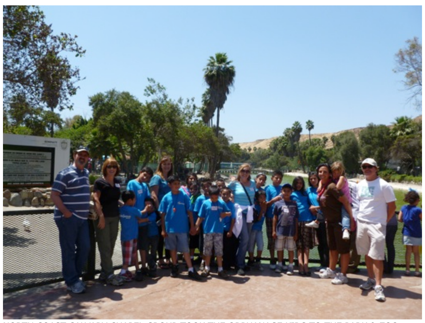
NORTH COAST CALVARY CHAPEL GROUP TOOK THE ORPHANAGE KIDS TO THE PARK & ZOO.