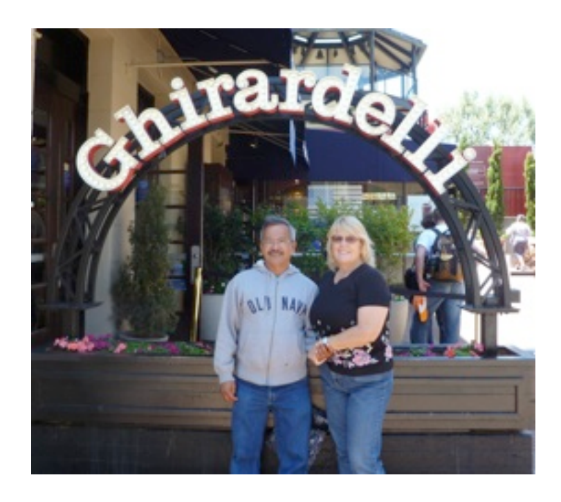
CELEBRATING OUR 3RD WEDDING ANNIVERSARY